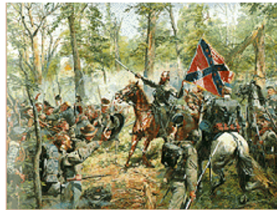
Emblems Of Valor" ( Painting battle honors on Battle Flag )