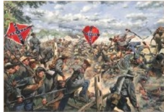
"Jackson Is With You" ( Jackson at Cedar Mountain )

"The Emmitsburg Road" ( The 7th and 52nd N.C. at Gettysburg )